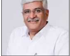
BY GAJENDRA SINGH SHEKHAWAT

The essence carried by this shloka from SrimadBhagavad Gita and from the civilisational wisdom enclosed in the Indian scriptures and traditions, is reflected in the essence of Somnath Temple, located at Somnath-Patan on the southern shore of Kathiawad (historic region in southwestern region of present-day state of Gujarat). Regarded as the first among the twelve Jyotirlingas, many a times its walls have borne the brunt of battle at the hands of barbarian invaders only to rise again and resume the drums and bells of worship. Across more than a thousand years of Indian history, SanaTana Dharma - understood as a diverse, decentralised constellation of religious practices, philosophies, rituals, and institutions - has experienced repeated moments of disruption arising from political conquest, regime change, and shifting structures of power. These disruptions included the destruction or repurposing of temples, monasteries, and centres of learning, as well as the displacement of patronage networks that had sustained religious institutions. Yet, despite these ruptures, the broader religious tradition endured, adapted, and reasserted itself across time. The historical significance of this endurance lies not in claims of uninterrupted dominance, but in the capacity of religious life to survive institutional loss and political vulnerability.