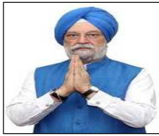
BY HARDEEP SINGH PURI